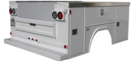
T Series Top Opening bodies