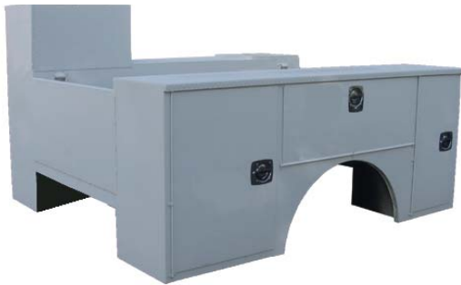
C and G Series Crane Bodies